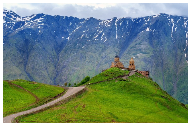
Levant Sparrowhawk, Niobe Fritillary, Gergeti Trinity Church